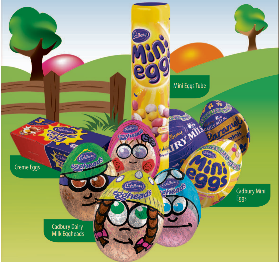
Mini Eggs Tube